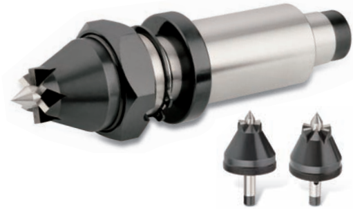
傳動齒+中心針 Driving pins + Centers pins